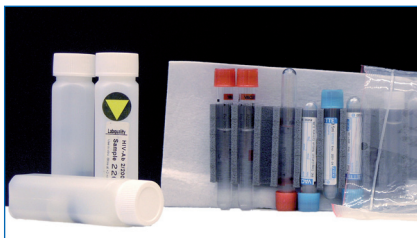
Picture 2. The secondary receptacle may also be a tightly closed plastic bag.